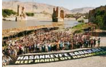
ECA Watch Austria